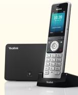
Yealink W60 Cordless solution $250