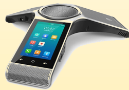
Yealink CP960 Conference / Boardroom $850