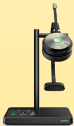
Yealink WH62 DECT Headset $198