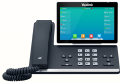
Yealink T54W Executive colour touch $450