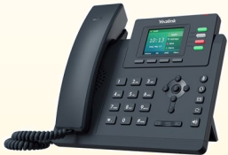
Yealink T33G Home office $189