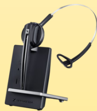
Sennheiser D10 USB DECT Cordless headset $310