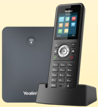
Yealink W59P Rugged cordless handset $390