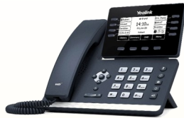
Yealink T53 Executive / Reception $270