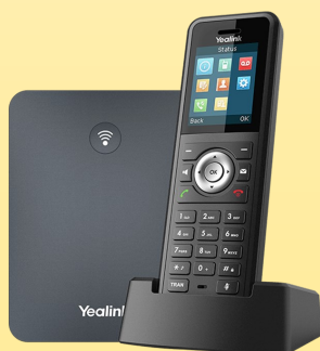
Yealink W59P Rugged cordless $390