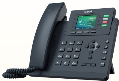
Yealink T33G $189