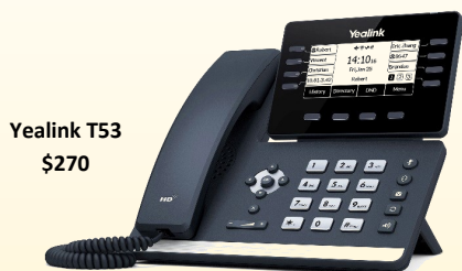
Yealink T53 $270