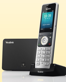
Yealink W60 $250